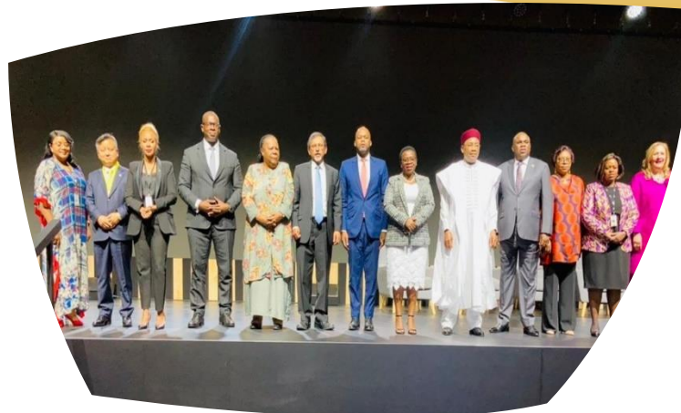
Photos: Delegates at the AfCFTA Business Forum in Cape Town, South Africa.

Among the key topics discussed, the conference explored challenges and opportunities pertaining to key sectors such as Pharmaceuticals, Automotive, Agribusiness, Transport and Logistics, and Digital Trade. In addition, operational tools such as the Pan African Payment and Settlement System, and other digital solutions developed to allow seamless flow of data, capital, and services were highlighted.