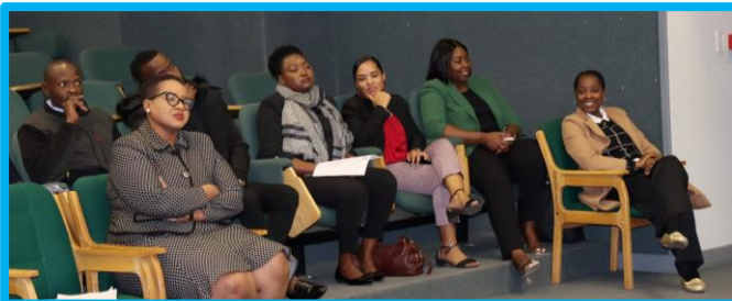
MIT Staff follow the proceedings at the Gemstone Graduation ceremony in Windhoek.