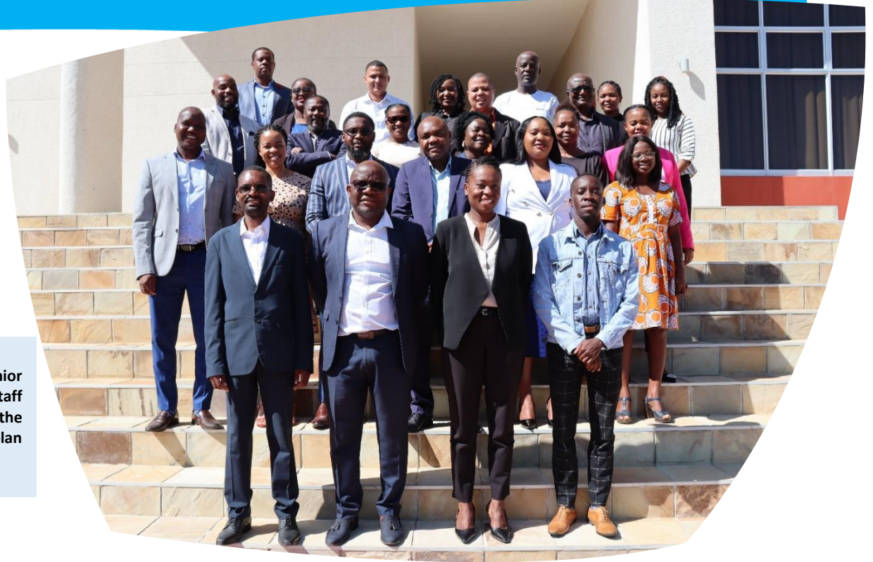
Photos: MIT Senior management and staff members pictured at the sidelines of the annual plan workshop.

The Ministry of Industrialisation and Trade held a two-day workshop to review its Annual Plan, Extension for the Strategic Plan and Annual Plan formulation in Windhoek.