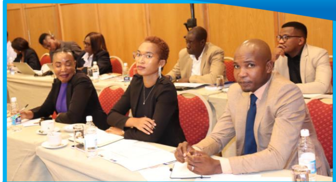
Staff members from the Commerce Sub-division attend the EU-Namibia Quality Infrastructure Forum hosted by the NSI in collaboration with the MIT in Windhoek.