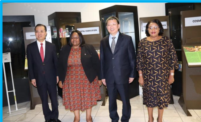
MIT's Minister, Hon. Lucia Lipumbu (second from left) and Deputy Minister, Hon. Verna Sinimbo pictured with a Chinese business delegation during a recent visit in Windhoek.