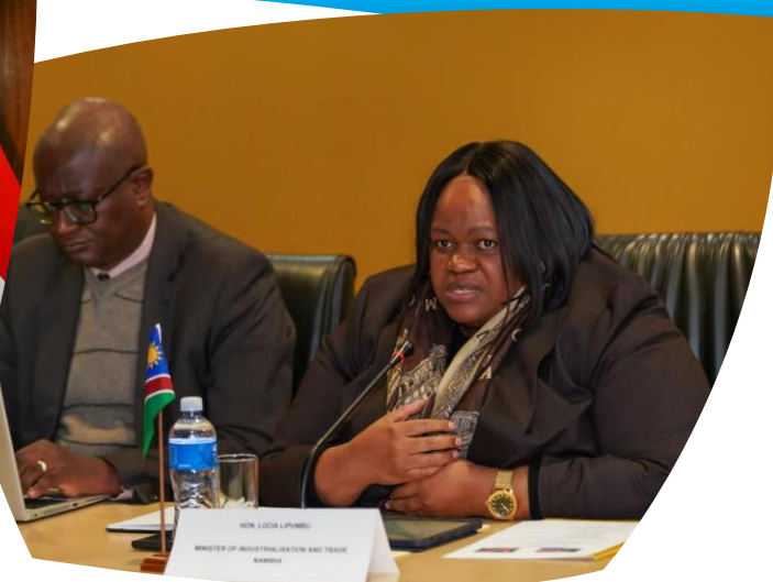
Photo: Minister of Industrialisation and Trade, Hon. Lucia lipumbu pictured with the Minister of Trade, Industry and Competition, Hon. Ebrahim Patel during the bilateral engagement held in Pretoria.

The Minister of Industrialisation and Trade, Hon. Lucia lipumbu led a Ministerial delegation to Pretoria, South Africa (SA) in June 2023, where she engaged her counterpart, Minister of Trade, Industry and Competition, Hon. Ebrahim Patel to deliberate on critical bilateral matters of mutual benefit between the two countries.