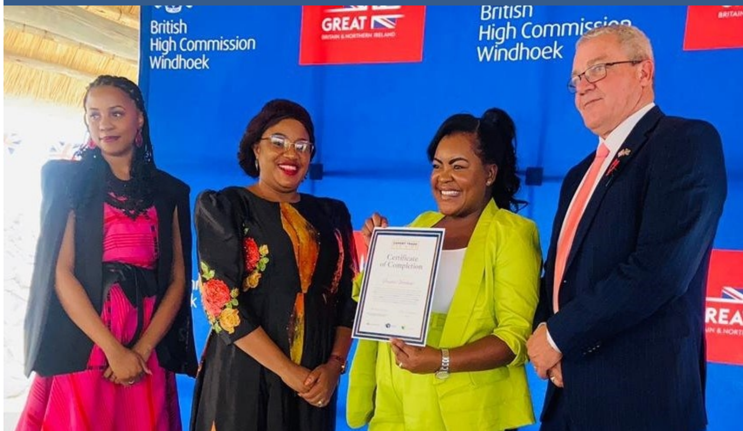
2nd from left: Hon. Verna Sinimbo (Deputy Minister - MIT), extreme right: H.E. Charles Moore (British High Commissioner to Namibia) pictured with participants at the graduation ceremony.

Hon. Verna Sinimbo (Deputy Minister of Industrialisation and Trade) delivered a keynote address at the Trade Forward Southern Africa (TFSA) Export Trade Training Graduation at the British High Commissioner's residence in the capital. At the event, 63 Namibian women business owners graduated after enrolling and completing modules in Export Assistance. The Export Trade Training Graduation programme operates across the SACU region to enhance regional trade and integration. Also, a mechanism through which the United Kingdom is enhancing partnership with both government and the private sector to promote a more inclusive economic environment. Most importantly, the training was designed to equip women entrepreneurs with critical skills and strategies to trade in a global market and increase capacity for businesses to enable them to become sustainable business owners. Conclusively, Hon. Sinimbo congratulated all graduates and urged them to explore vast opportunities presented through the acquired training.