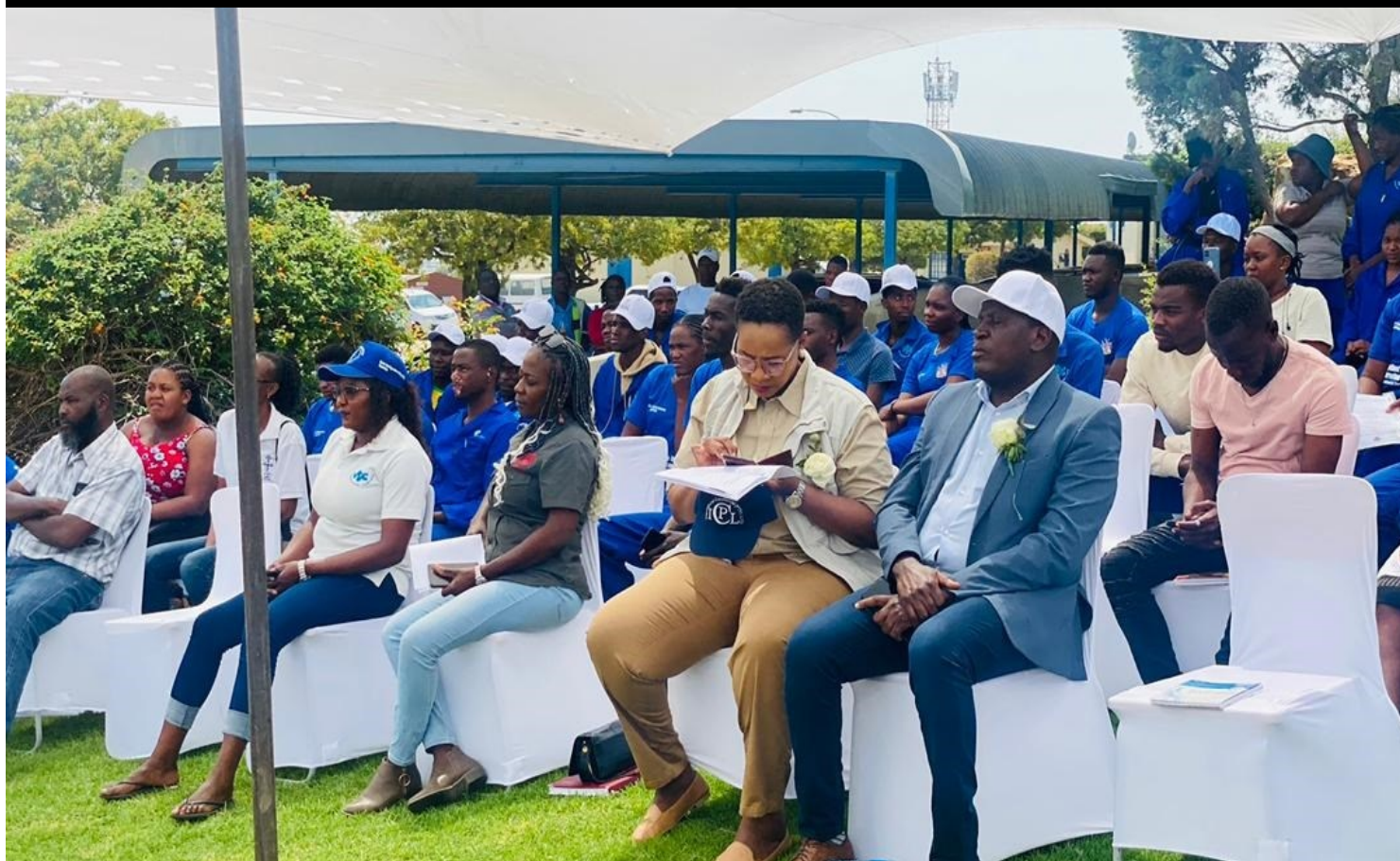
Some of the participants at the event