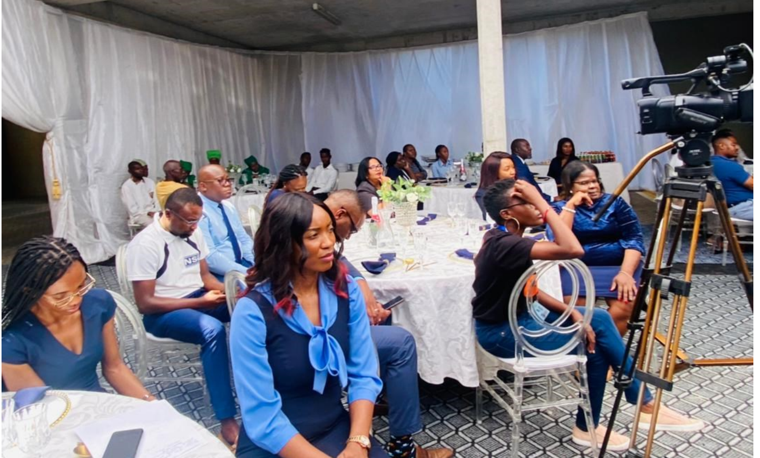
Some of the participants at the event