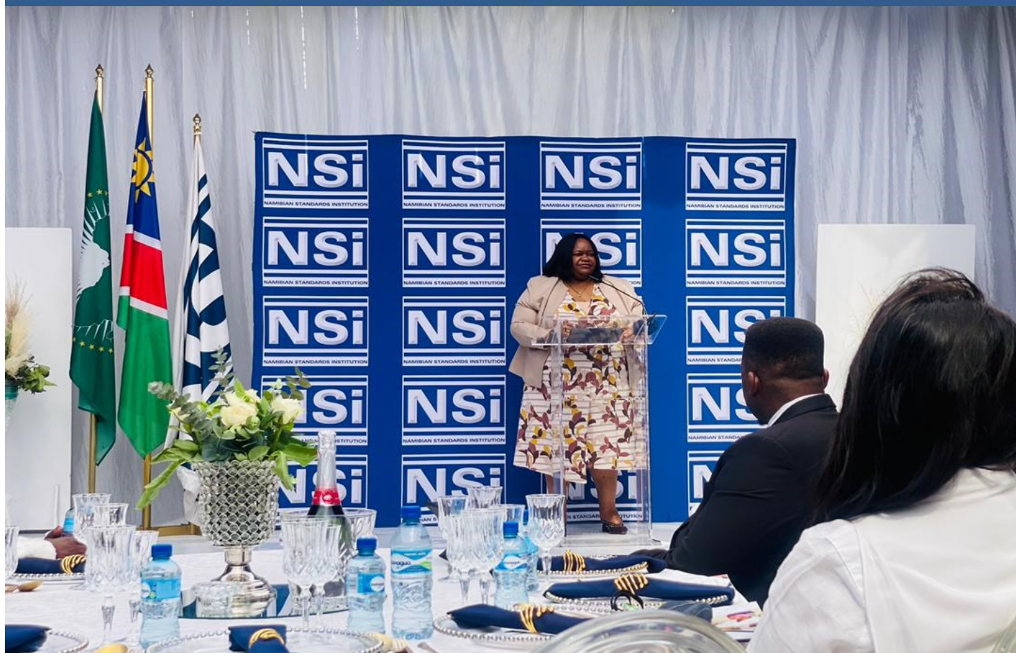
Hon. lipumbu delivering her keynote address at the event.

The Minister of Industrialisation and Trade (MIT), Hon. Lucia lipumbu officially inaugurated the Namibian Standards Institution (NSI) Head Office in the capital on 12 September 2022. The NSI is an agency of the Ministry, established in terms of the Standards Act, (Act No. 18 of 2005) - the institution is tasked to promote the use of standards and quality assurance and control in industry, commerce and public sector; provide conformity assessment services; certification of systems, product and personnel systems; inspect and test products and materials; and trade (legal) metrology – enforcement of product labelling, weights and measures. In her keynote address, Hon. lipumbu emphasized the need to ensure adequate infrastructure to enable the institution to deliver on its mandate and display growth in asset base. At the same event, Hon. lipumbu fondly bade farewell to the outgoing Namibian Standards Council members and ardently welcomed the incoming members of the Council – implored them to serve to the best of their ability. 'I have no doubt, that the new building will improve the operational and administrative capacities of the NSI to the satisfaction of the NSI stakeholders, the business community and the Namibian people at large' – Hon. lipumbu.