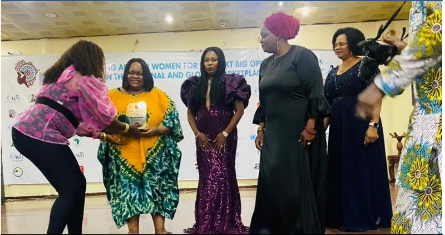
2 nd from left: Hon. Lucia Iipumbu (Minister of Industrialisation and Trade) receives the prestigious Woman of the Year 2022 award at the occurrence.

Hon. Lucia Iipumbu (Minister of Industrialisation and Trade) attended the Africa Women in Trade Conference from 28 to 29 September 2022 at Rockview Hotel in Abuja (Nigeria). The second series of the African Women in Trade Conference invited Hon. Iipumbu as a special guest speaker at the event. At the same occasion, Hon. Iipumbu was awarded the prestigious Woman of the Year 2022 award by the Organization of Women in International Trade (OWIT). The award took place in the framework of an official ceremony, recognizing Honorable Minister as an exceptional woman who is dynamic, trailblazing and for advancing the status of women in international trade and business through excellence and innovation. Nigeria's Trade and Investment Support Organisation (TISO) operates within its strategic engagement plan which includes components such as improving knowledge and skill base of women in trade laws, policies, rules and procedures, creating multiple-stakeholder platforms where private sector actors, public sector administrators and policymakers can work together towards the effective implementation of trade facilitation measures for women. We take pride in congratulating Hon. Lucia Iipumbu (Minister of Industrialisation and Trade) for being conferred the prestigious award.