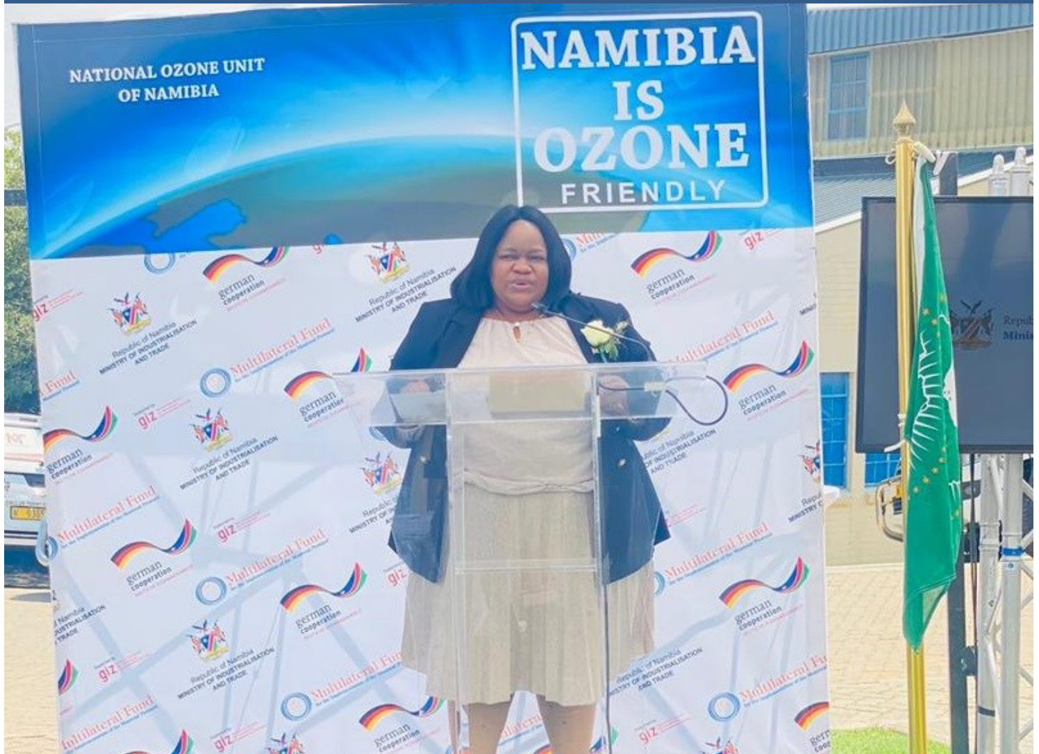
Hon. Lipumbu delivering her keynote address at the event.

Annually, 16 September is celebrated as the International Day for Preservation of the Ozone Layer. The National Ozone Unit (NOU) in the Ministry of Industrialisation and Trade continues to create awareness of the global ozone layer protection. Life on earth would not be possible without sunlight. Yet, the energy emanating from the sun would be too much for life on earth to thrive devoid of the ozone layer. This year's commemoration was themed - 'Montreal Protocols@35: Global Cooperation protecting the life on Earth' . The event was held at Windhoek Vocational Training Centre and Hon. Lucia Lipumbu (Minister of Industrialisation and Trade) was the keynote speaker. In her address, Hon. Lipumbu beseeched the audience to commit and rededicate themselves to ensure the phasing-out of Ozone Depleting Substances and guarantee Namibia to remain compliant to the Montreal Protocol.