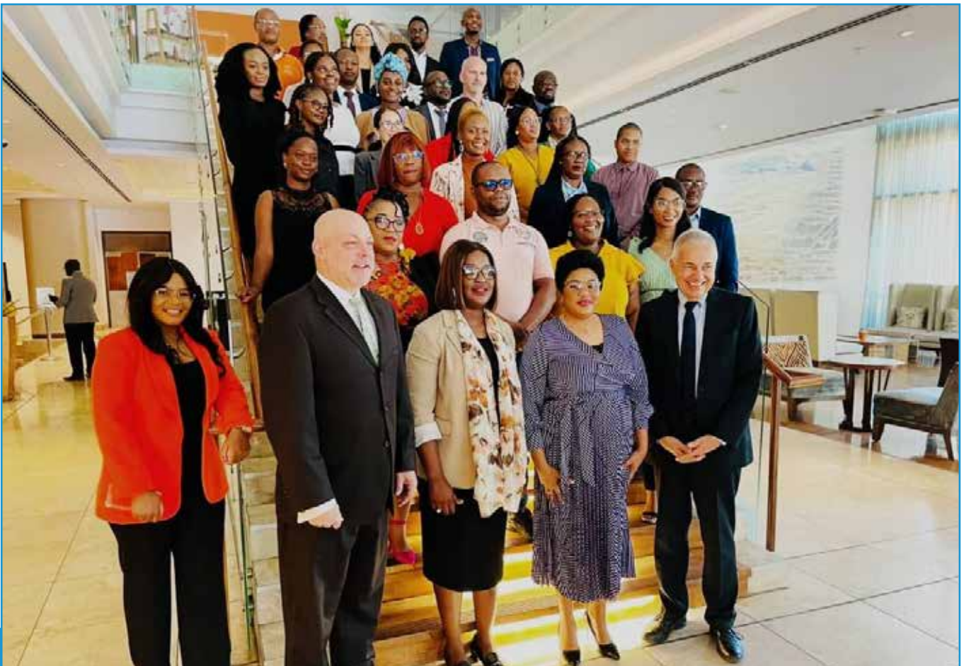
Photo contributed: Hon. Verna Sinimbo, Deputy Minister of Industrialisation and Trade pictured with participants at the Southern Africa Workshop on Consumer Protection and E-Commerce earlier today at Hilton Hotel, Windhoek

Hon. Sinimbo indicated that Consumer protection is considered a basic regulatory enabler for digital financial inclusion, hence there is a need to protect consumers, and thus a better protection of consumers may enhance their trust and increase their usage of normal financial services. Furthermore, Honorable Deputy Minister cautioned consumers to be suspicious of fraud and extended her gratitude to all stakeholders partaking in the workshop and in particular to Federal Trade Commission for partnering with MIT to host the workshop.