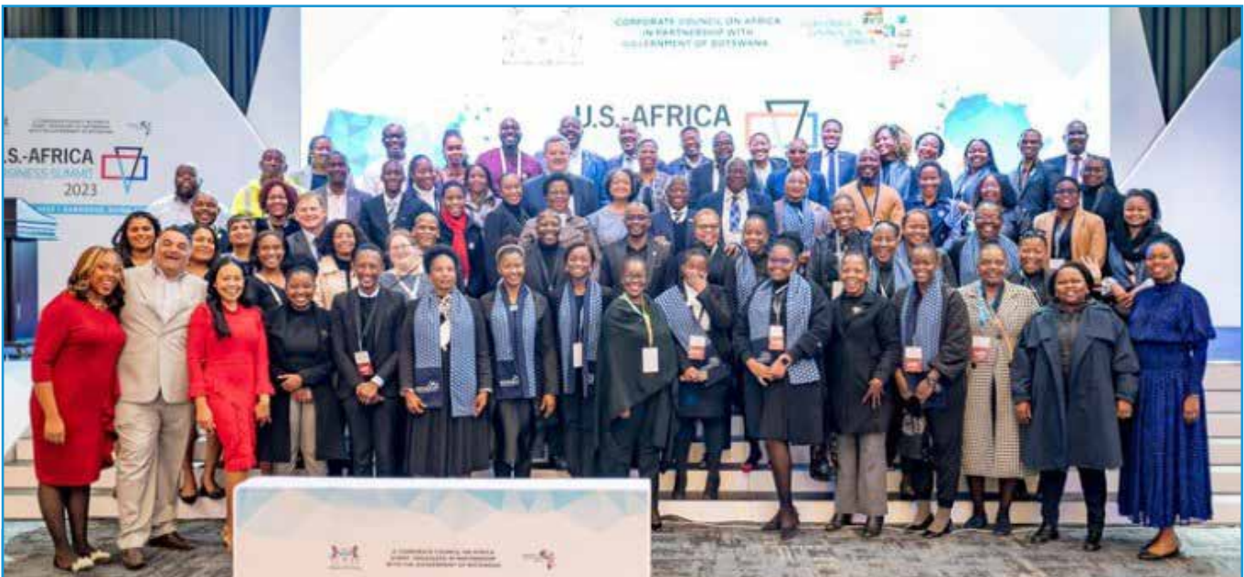
Photo contributed: The Namibian High-level delegation to the US - Africa Business Summit, pictured post the event.

The theme of the summit was “Enhancing Africa’s Value in Global Value Chains,” with a focus on strengthening trade and investment opportunities between the United States and Africa. The summit aimed to foster renewed commitments among stakeholders and encourage the United States to expand its trade initiatives and pursue agreements beyond the Africa Growth and Opportunity Act (AGOA), thus boosting Africa’s trade potential.