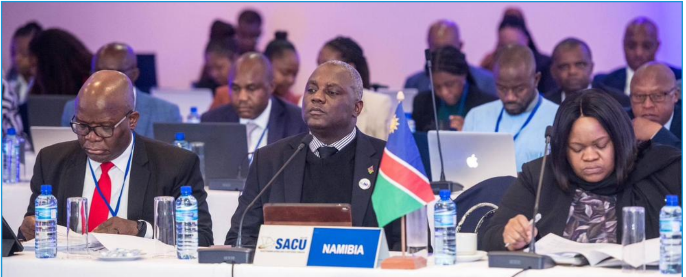
Photo: Hon. Lipumbu (on the right) pictured during the SACU meeting

Hon. Lucia Lipumbu (Minister of Industrialisation and Trade) attended the 49th Meeting of the SACU Council of Ministers convened in the Kingdom of Eswatini to consider the Report of the 72nd Commission in preparation for the 8th Summit of the SACU Heads of State or Government.