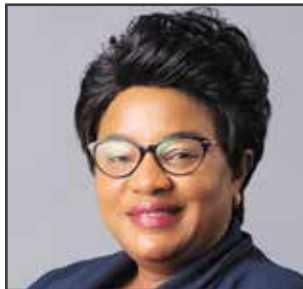
Hon. Verna Sinimbo Deputy Minister