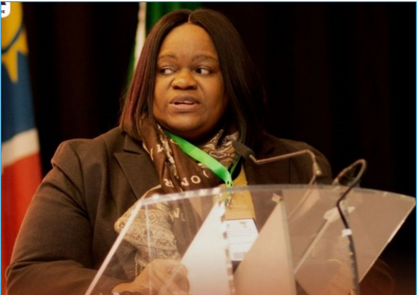
Hon. Lucia Lipumbu delivering her keynote address at the event.

Minister of Industrialisation and Trade, Hon. Lucia Lipumbu officiated the opening of the workshop that paved way to deliberate on matters relating to value addition and innovation; support mechanisms for formal and informal traders; intellectual property and rights; barriers to entry and effective participation; discriminatory customs and practices; capacity building; and standards and origin certification. "The SADC Youth Voice is important in this process and we want to negotiate in your best interest", Honorable Minister said.