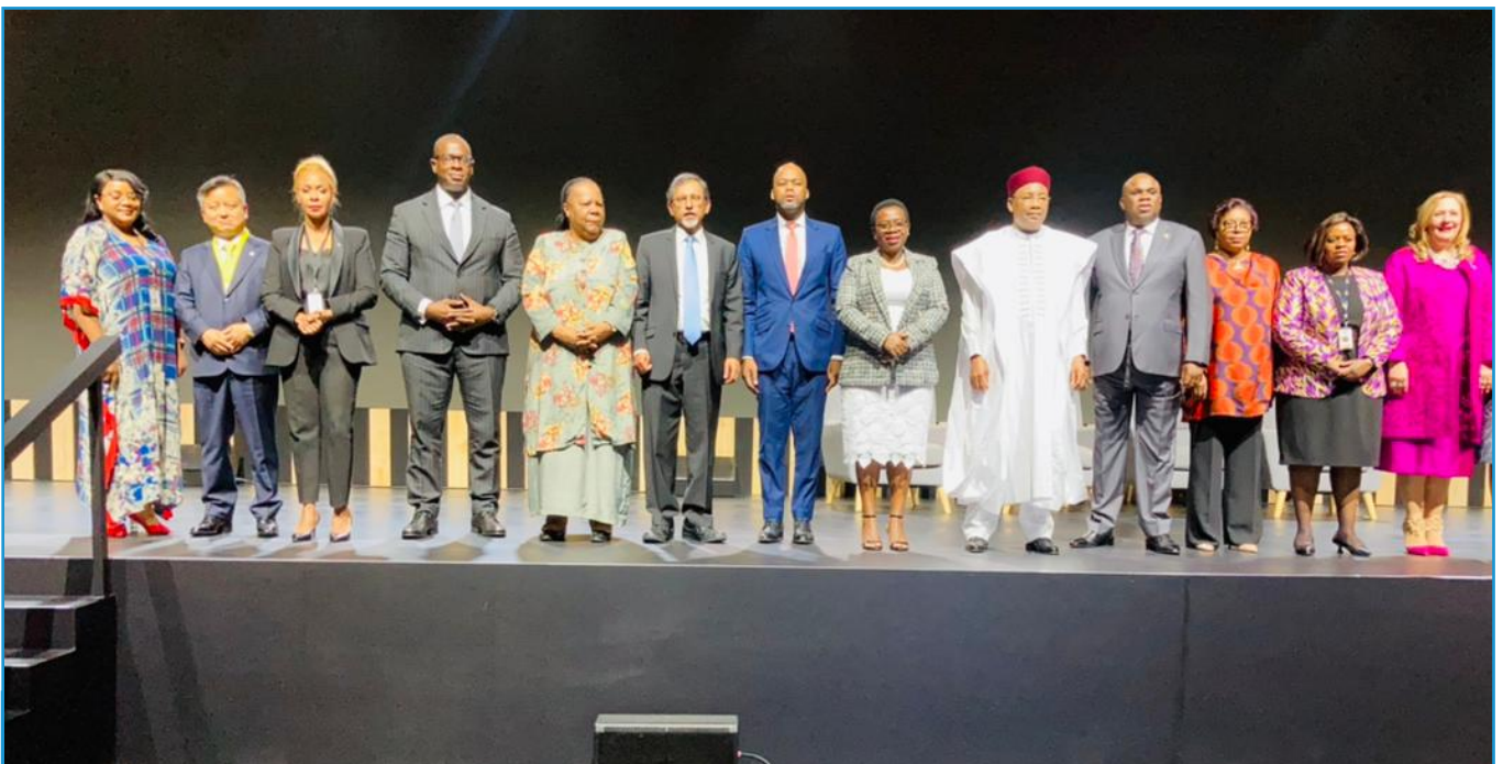
(Picture contributed) Extreme left: Hon Sinimbo in attendance at the official opening of the AfCFTA Business Forum in Cape Town.

Deputy Minister of Industrialisation and Trade, Hon. Verna Sinimbo was in attendance at the official opening South Africa), themed “Accelerating Implementation of the AfCFTA”. The AfCFTA Secretariat in collaboration with the South African Government convened the AfCFTA Business Forum that lasted for four days and the event. The assembly of dignitaries at the event sought to present a platform to enable the private sector to unlock trade and investment opportunities in priority sectors namely Agriculture, Ago-processing, Pharmaceuticals, Automotive, Transport, Logistics as well as payment systems among others. Forum assembled together notable players on the continent to accelerate and activate trade and investment activities under the umbrella of AfCFTA implementation.