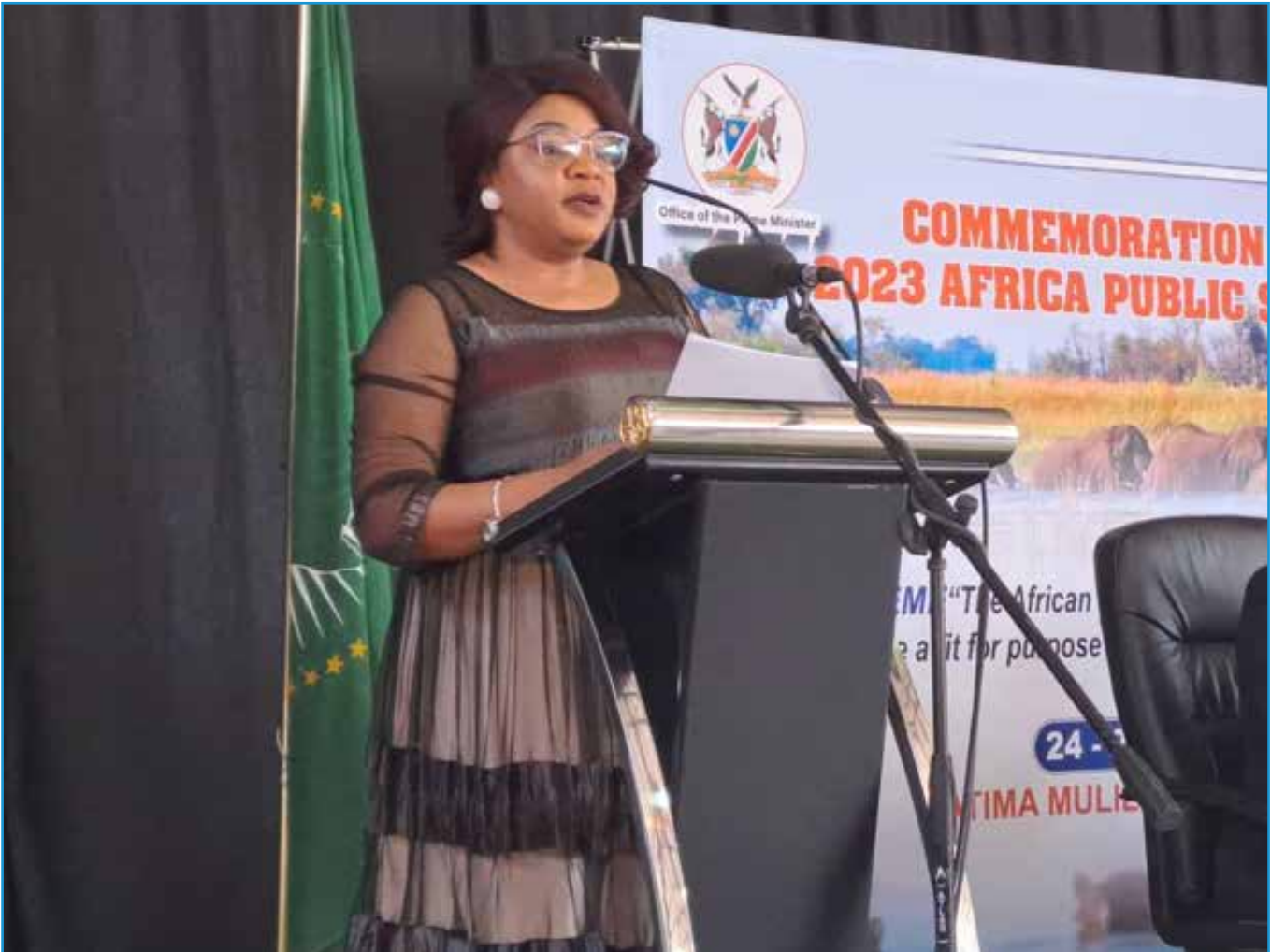
Photo contributed: Hon. Sinimbo pictured during the APSD main event at Katima Mulilo.

Hon. Sinimbo in her statement aligned to the theme aptly captured “The African Continental Free Trade Area will require a fit for purpose African Public administrators to succeed” opined the need to eliminate barriers to trade amongst African States and instead promote digital transformation to achieve increased trade and economic growth while embracing work ethics and customer service which are a priority for Government.