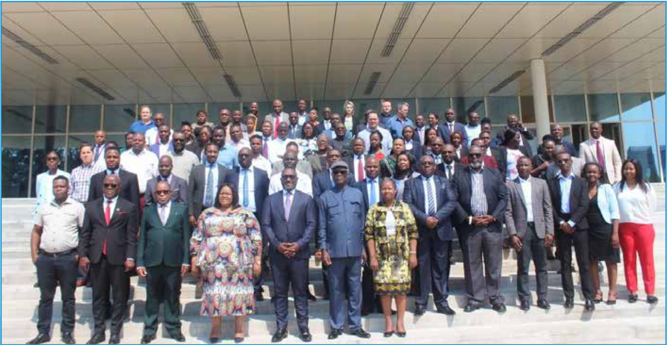
Photo contributed: Participants at the Namibia-Zambia Joint Trade & Investment and Business Forum in Lusaka.

Hon. Lucia lipumbu (Minister of Industrialisation and Trade) led a delegation comprised of Senior Government Official and Business people to Lusaka Zambia to participate in the Namibia - Zambia Joint Trade and Investment Committee Meeting and Business Forum from 05 - 06 September 2023.