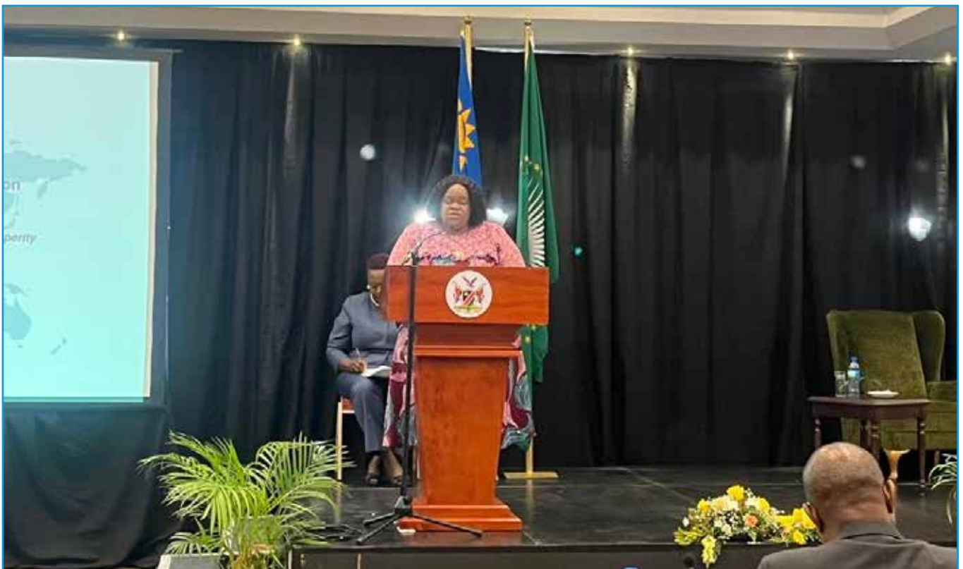
Photo contributed: Hon. Lucia Ipumbu (Minister of Industrialisation and Trade) addressing the 9th session of the Namibian Heads of Mission Conference.

The Minister of Industrialisation and Trade, Hon. Lucia Ipumbu, addressed the Namibian Heads of Mission Conference, held on 1 November 2023 at Mercure Hotel in Windhoek. During her key note address, Hon. Ipumbu highlighted the Trade Facilitation Agreement (TFA) that was put into force on the 22 February 2017, which calls for member states to address, reform, establishing or adopting measures that will facilitate cross border trade, to ensure expedient movement and clearance of goods destined for domestic market or in transit to other states in a non-discriminatory manner.