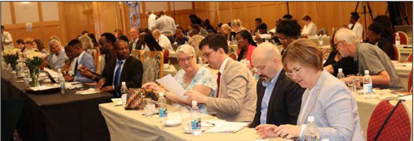
Picture of participants at the EU/Namibia Quality Infrastructure (QI) Forum held in Windhoek.

The Ministry of Industrialisation and Trade, EU Twinning project, together with its partners and Namibian Standards Institute hosted the first ever EU/Namibia Quality Infrastructure (QI) Forum on 18 April 2023, in Windhoek. The Forum aimed at providing knowledge on how the different elements of the Quality Infrastructure systems are beneficial and crucial in achieving short and long-term economic development, social well-being, and emancipate global trade.