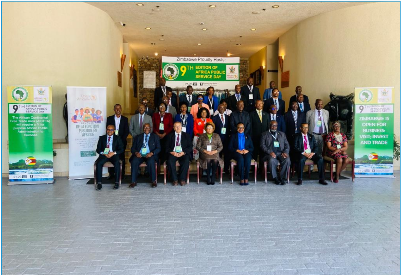
Photo: Photo contributed: Hon. Sinimbo pictured with Ministers of Public Services from participating Member States at the APSD celebrations in Victoria Falls.

Deputy Minister of Industrialisation and Trade, Hon. Verna Sinimbo led a delegation to attend and participate at the 9th edition of the Continental Public Service Day (APSD) celebration scheduled from 21 – 23 June 2023 at Elephant Hills Hotel in Victoria Falls (Republic of Zimbabwe). The 2023 APSD celebration was themed – “THE AFRICAN CONTINENTAL FREE TRADE AREA (ACFTA) WILL REQUIRE A FIT FOR PURPOSE AFRICAN ADMINISTRATION TO SUCCEED”.