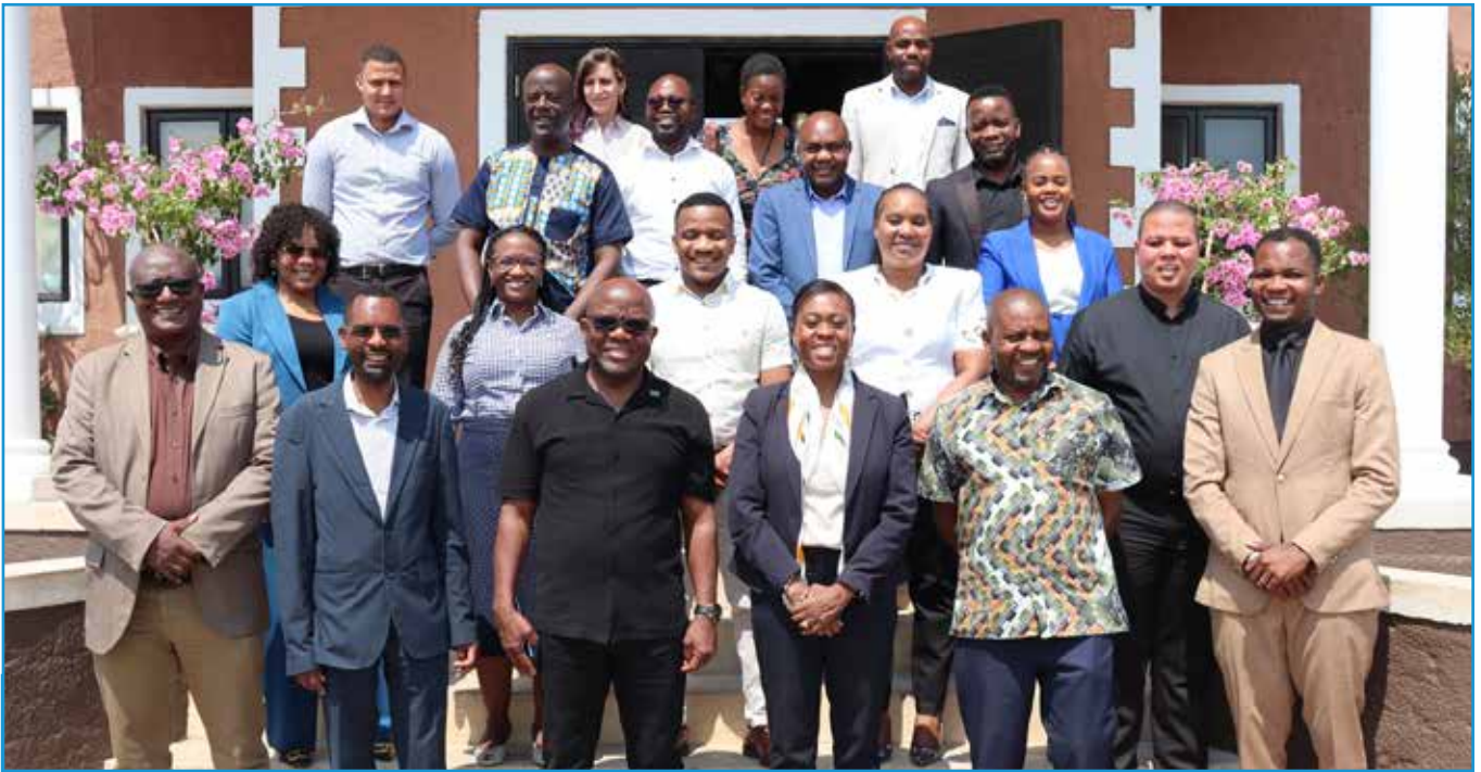
Group photo of MIT Management cadre and support staff at the session.

The assembly aimed to underpin achievements as well as to seize setbacks and improve on them. The discussions of the gathering focused on re-examining past activities and formulating new ones to reaffirm the right trajectory beyond the period under review.