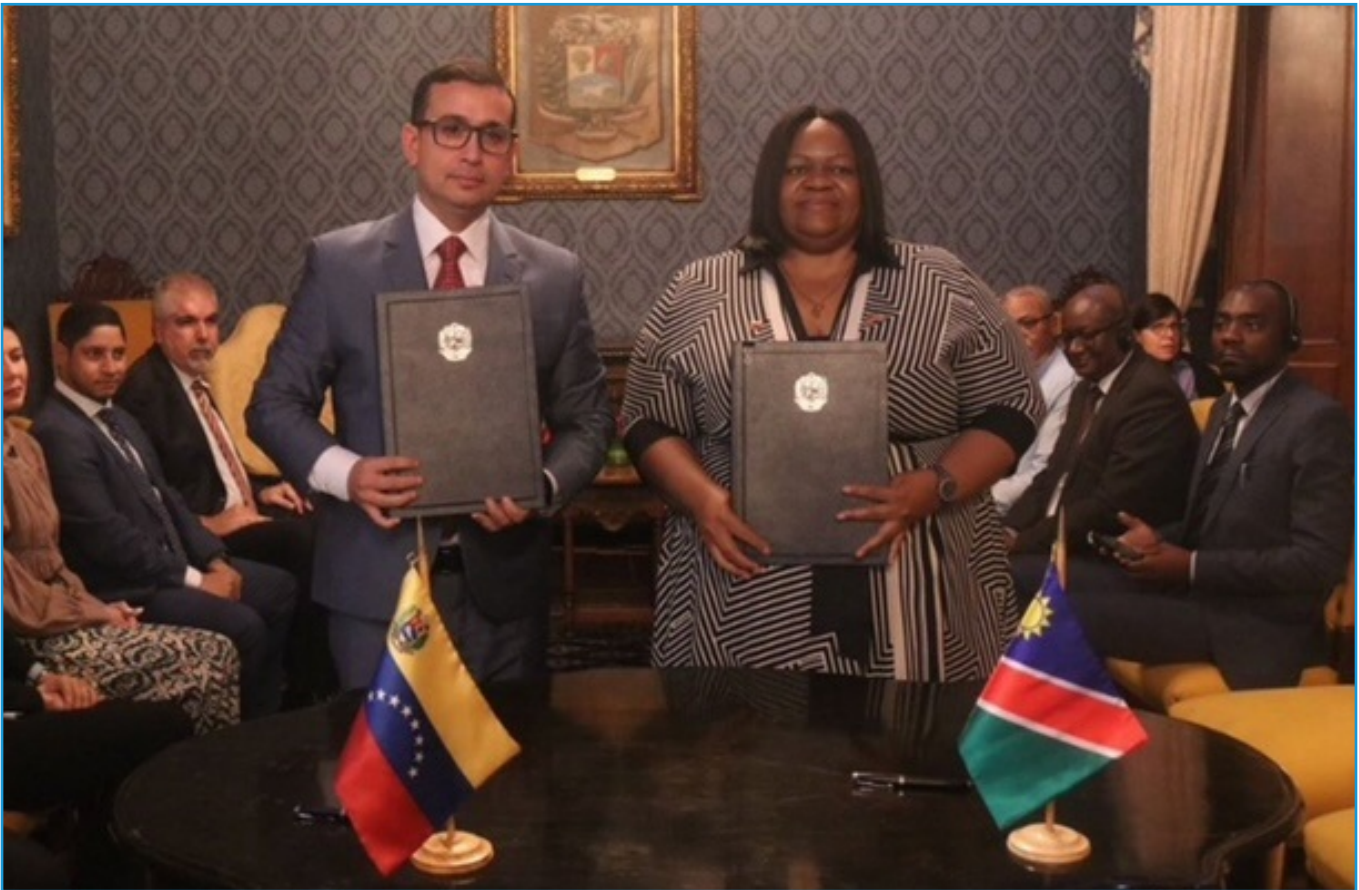
Photo contribute: Hon. Lucia Iipumbu (Minister of Industrialisation and Trade) pictured with Johann Álvarez Márquez, (Vice Minister for Foreign Trade and Investment Promotion of Venezuela).

The visit further intended to follow up on the commitments and talks within the framework of the first Venezuela-Namibia Joint Commission of Cooperation (JCC) that took place in March 2023 in Windhoek, Namibia, specifically in the identified economic areas of interest encompassing trade, agriculture, mining and housing. The Bolivarian Republic of Venezuela and the Republic of Namibia signed a Memorandum of Understanding (MoU) on Trade and Economic Cooperation on 30 November 2023, as a glowing testimony to fortify bilateral ties between the two countries. Entering into this MoU with Venezuela will benefit Namibia through economic intelligence/information exchange, the development and exploitation of trade, industrial cooperation, and investment opportunities.