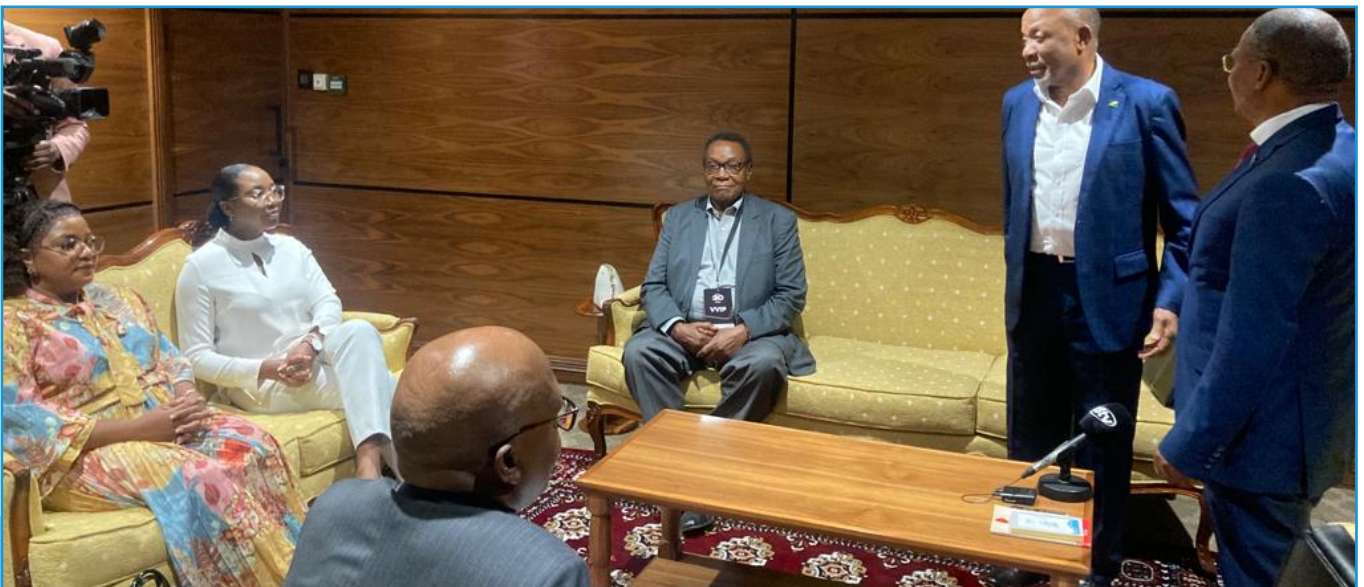
Photo contributed: Extreme left: Hon. Sinimbo among other dignitaries on official mission to Botswana.

Deputy Minister of Industrialisation and Trade, Hon. Verna Sinimbo was part of the delegation that accompanied, Vice President of the Republic of Namibia, H.E. Dr. Nangolo Mbumba on a mission to Botswana from 23 – 26 April 2023 to attend the Forbes under 30, 2023 summit.