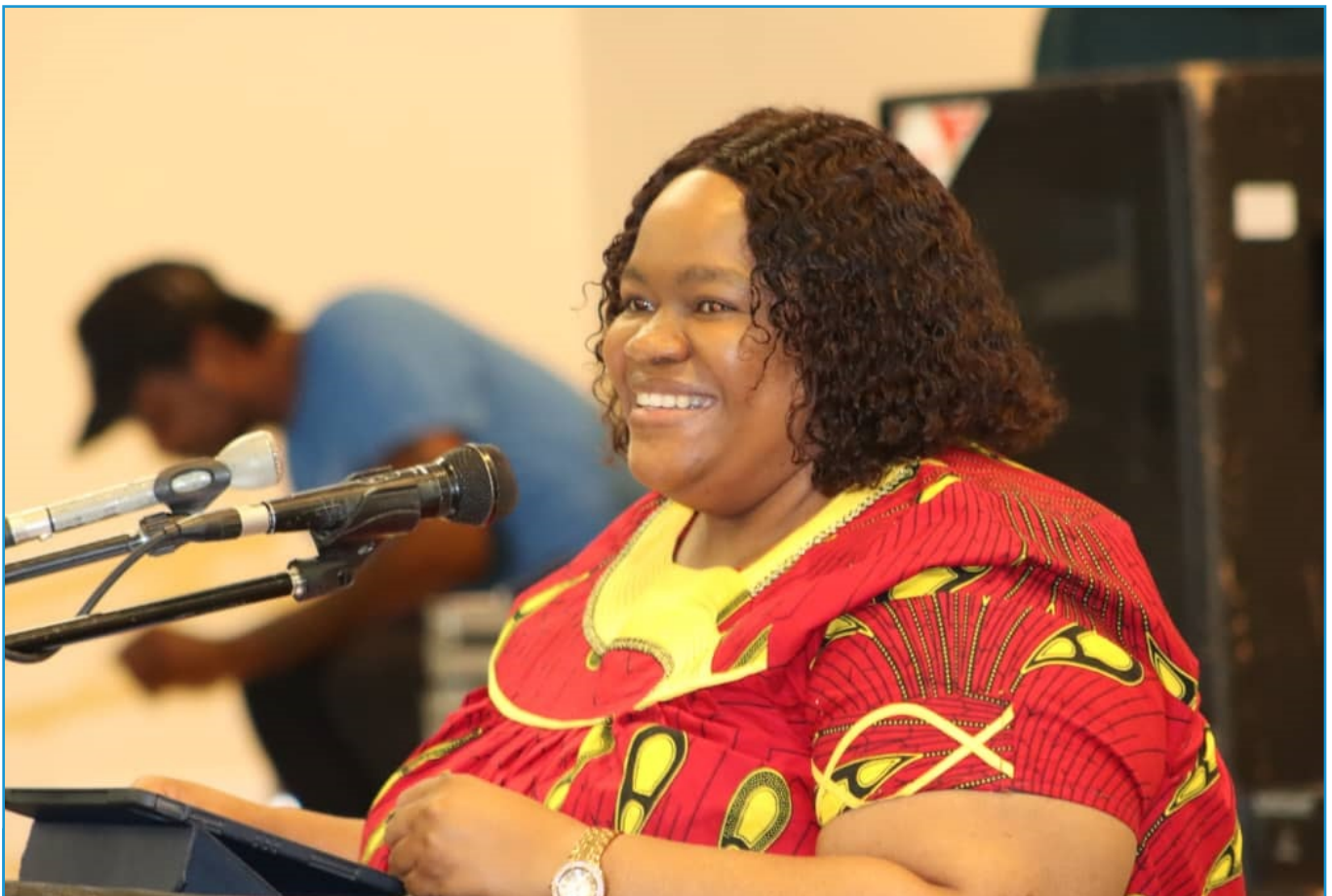
Photo: Hon. Lucia lipumbu (Minister of Industrialisation and Trade) delivering her statement at the expo.

The region has a good performance in agricultural activities, as witnessed over the years, in yielding grapes and dates for local and export markets, as well as the huge potential of small stock farming , Hon. lipumbu noted. The Minister indicated that the country needs to embrace the shift in the economic landscape, especially with the developing industries such as Green Hydrogen and the recent discoveries of oil and gas that are mostly based in the // Kharas region. She urged the residents to ensure benefitting from all the opportunities present in the region.