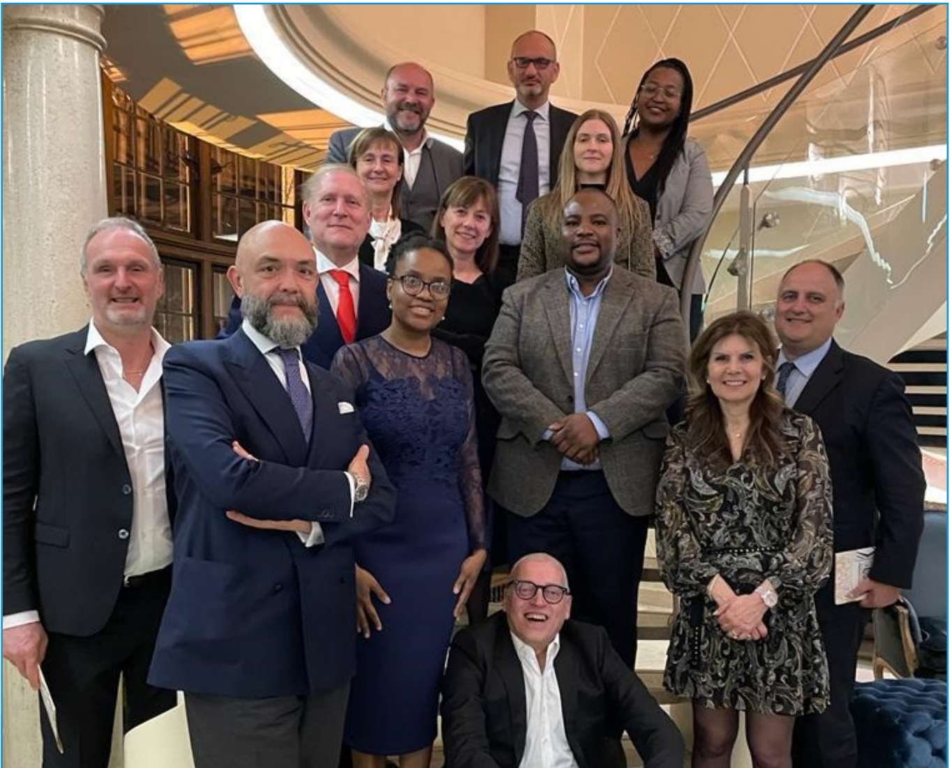
Members of the Mission and esteemed participants at the event.

The event attracted over 35 participants across multiple sectors and edition a second of the same event is being organized to further fulfil the Mission’s mandate of promoting Namibia as a preferred investment destination.