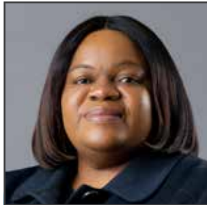
Hon. Lucia Lipumbu Minister (MP)